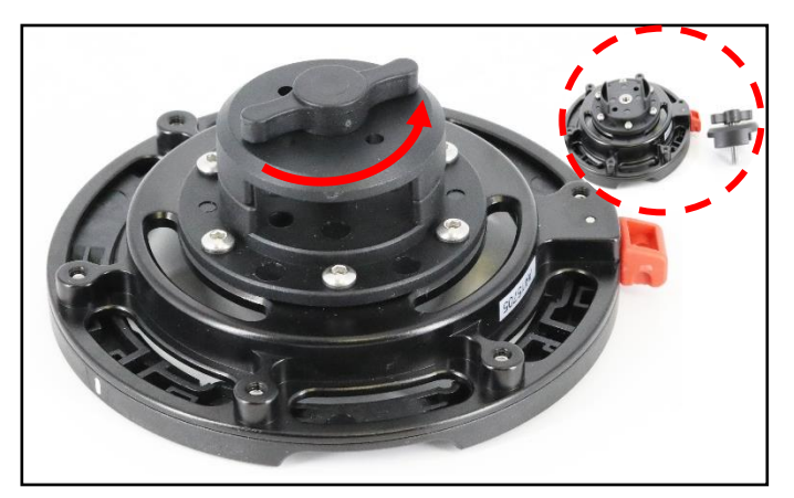
Remove the mounting cap from the bayonet holder by turning the thumb screw unti-clockwise.