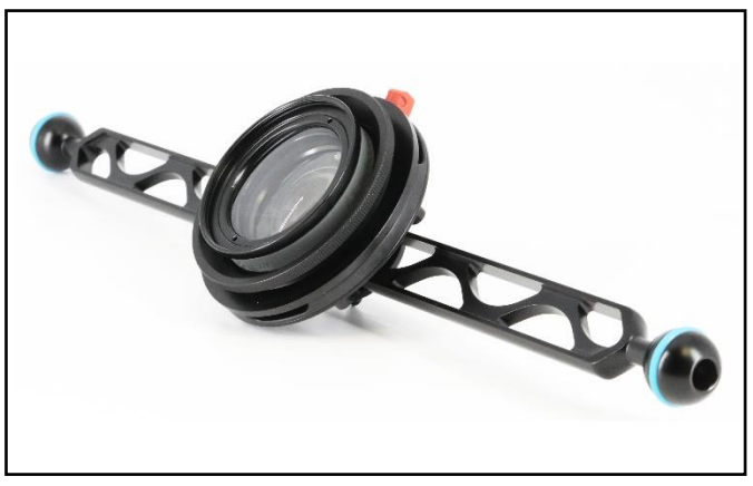
Example: CMC with bayonet adaptor on the bayonet holder.