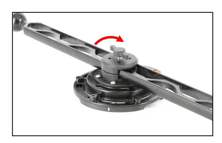
Align the mounting cap with the holder, and secure it by tightening the thumb screw until it can not go any further.